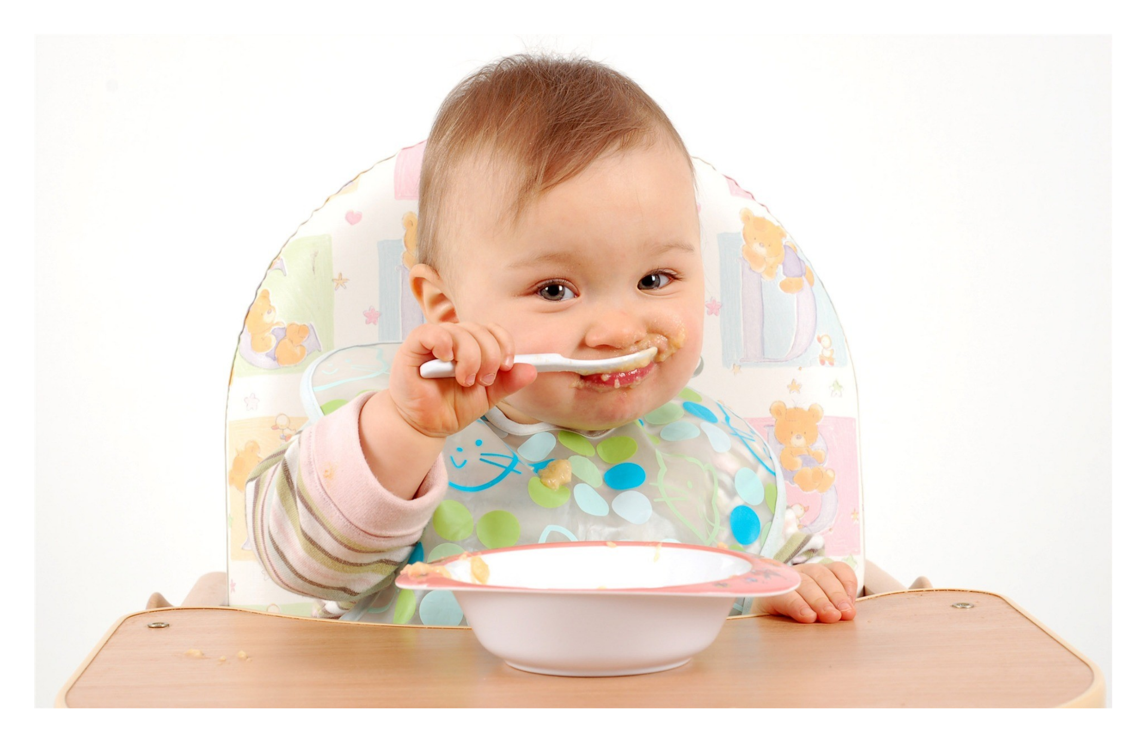
The proof of the pudding is in the eating