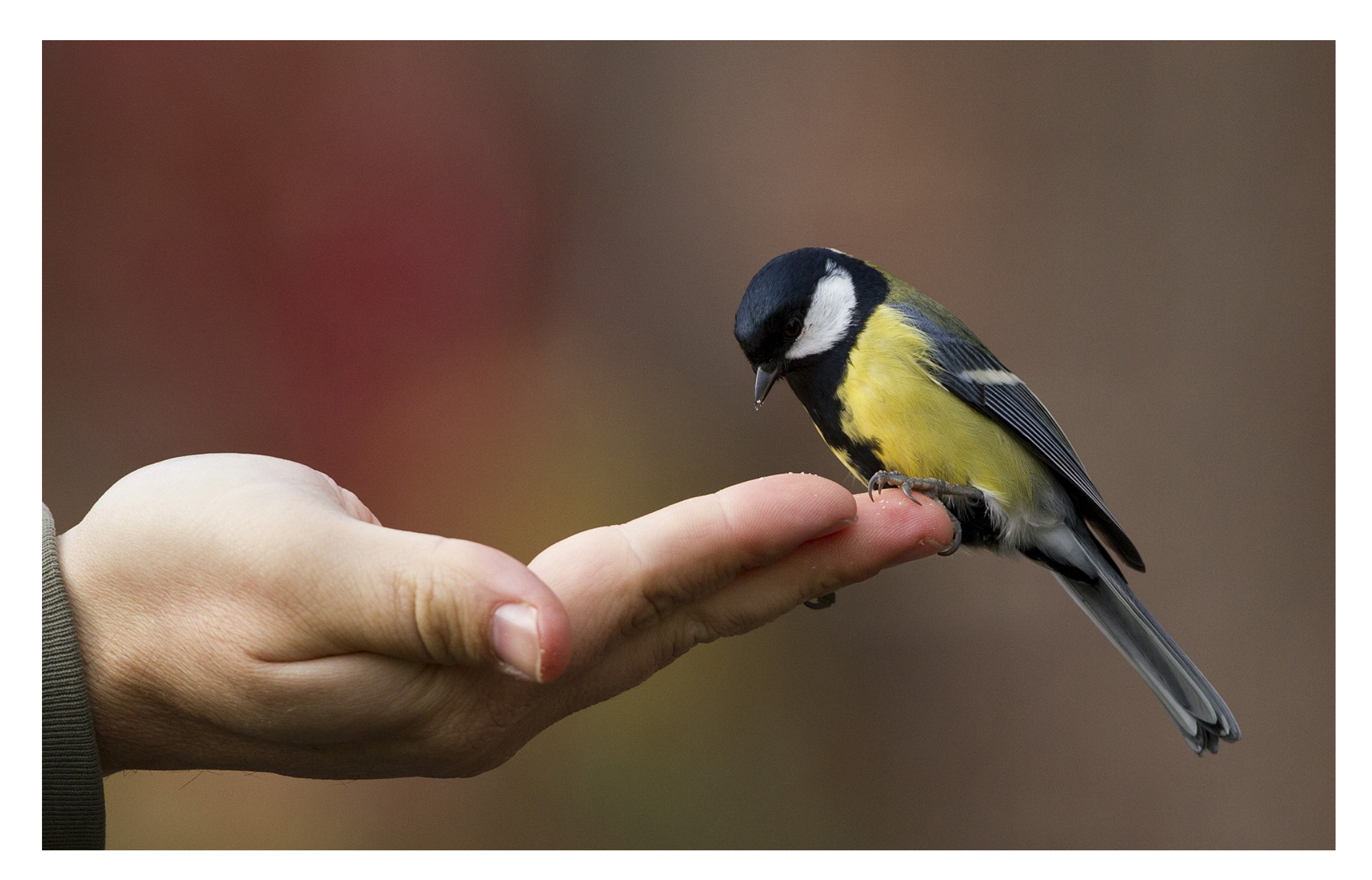
A bird in the hand is worth two in the bush