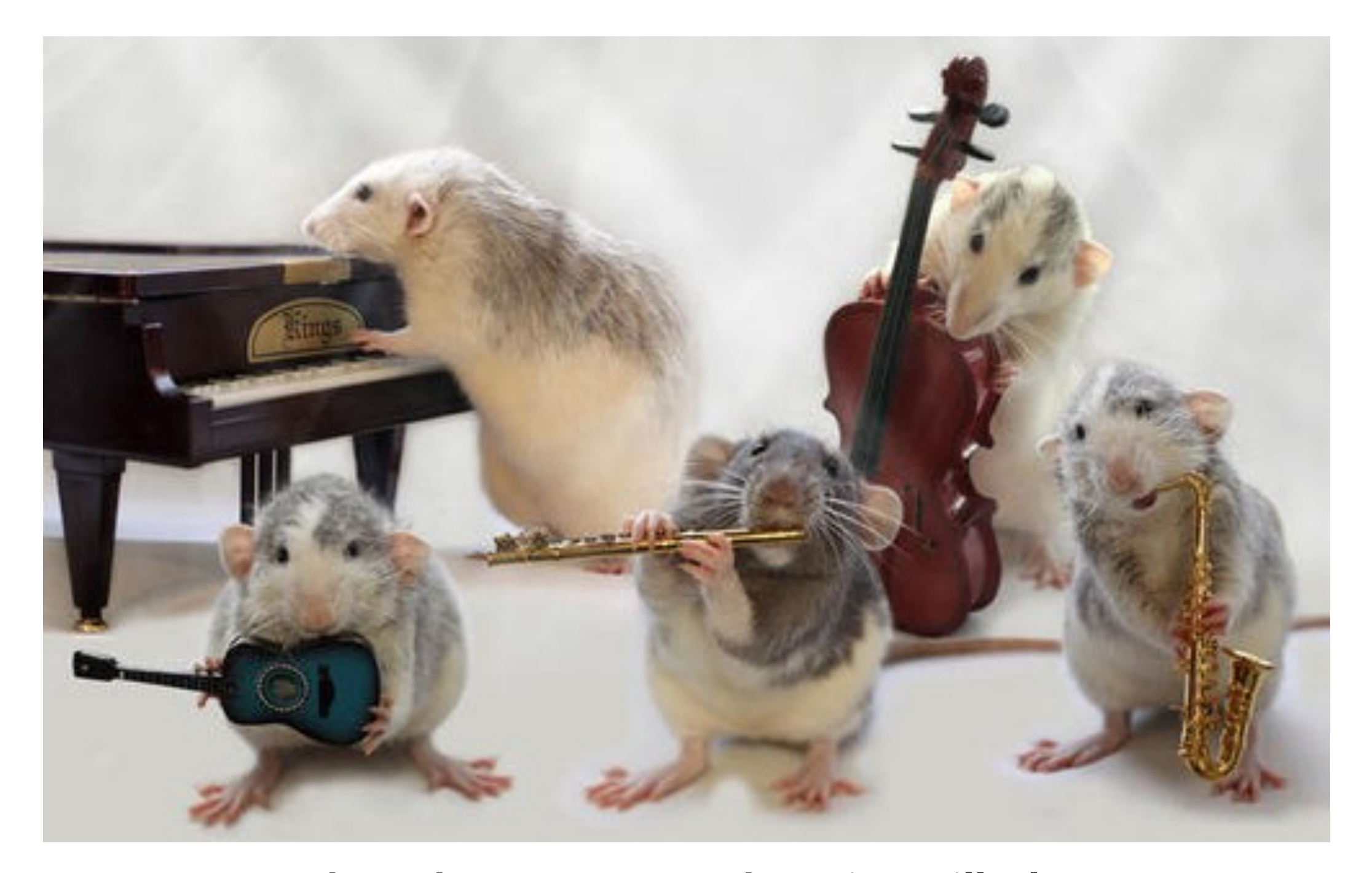
When the cat's away, the mice will play