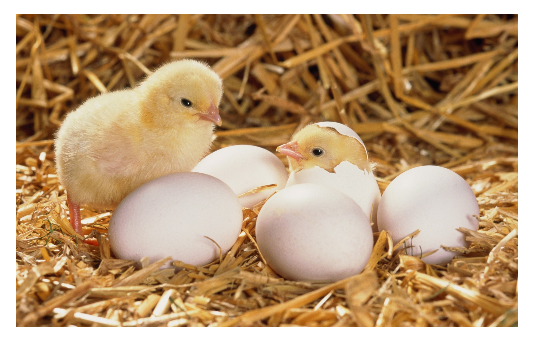
Don't count your chickens before they hatch