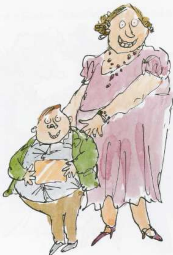
Here is Augustus with his mother.

The next day, Augustus found the first ticket. He was a greedy boy, and nobody liked him.