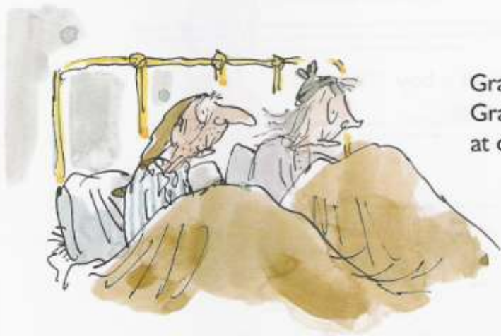
Grandpa Jo and Grandma Josephine at one end,

The other four people were Charlie's grandparents. They were so old they stayed in bed all day and never got up. But they didn't have much room because they slept in the SAME bed,